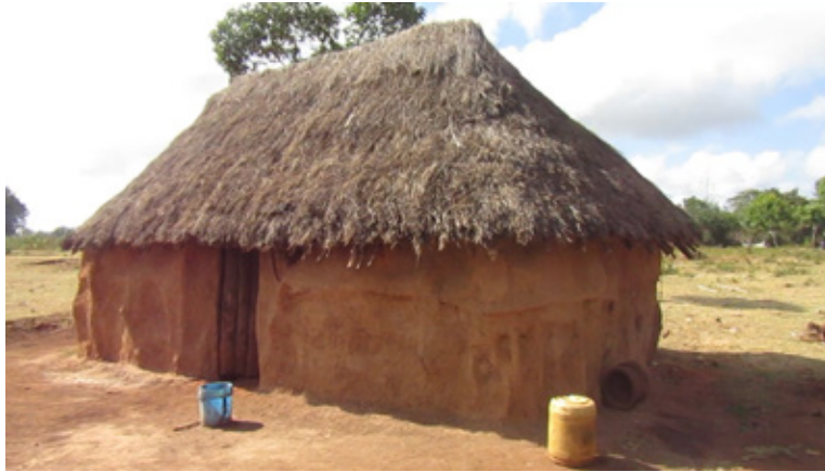
Hut: this is where most of the family sleep, sharing the space with some small animals such as chickens or ducks.