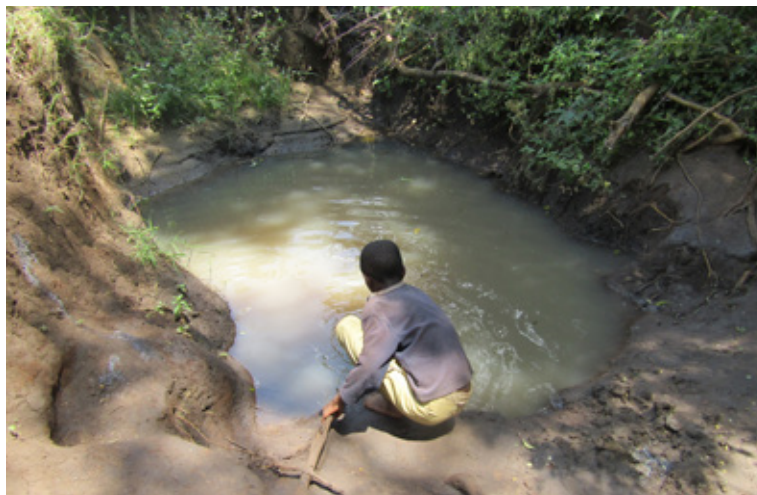
Scoophole where they fetch water

The budget for the house is 20.000€ (50 milion Tanzanian Shilling). A list of price references, along with a site plan, will be sent after registration.