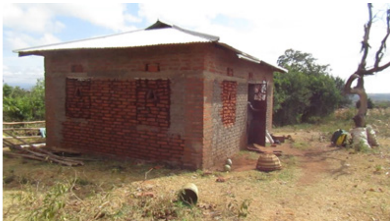
Nico's brick house: still under construction.