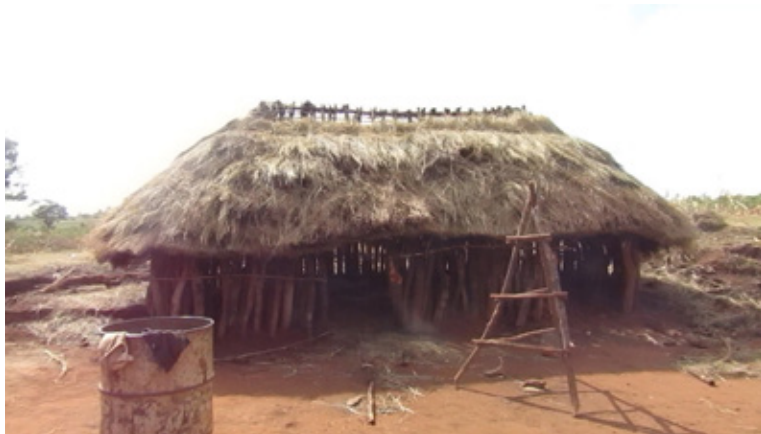
Hut: this one is being rebuilt. Dad is currently sleeping here.