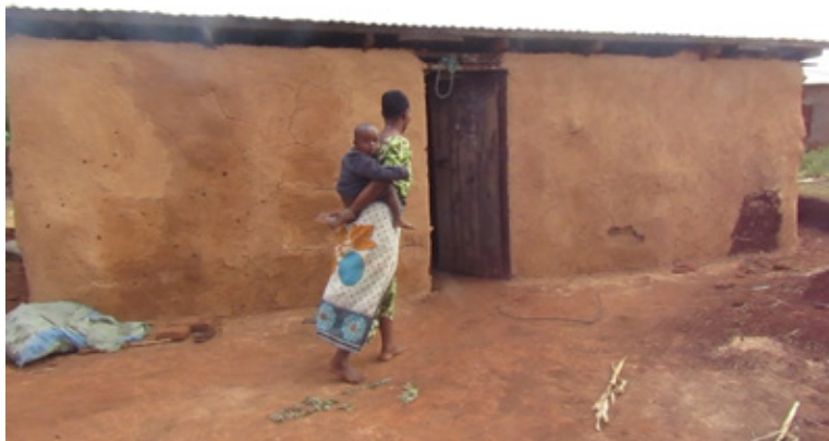
Hut: used as interior kitchen and storage.