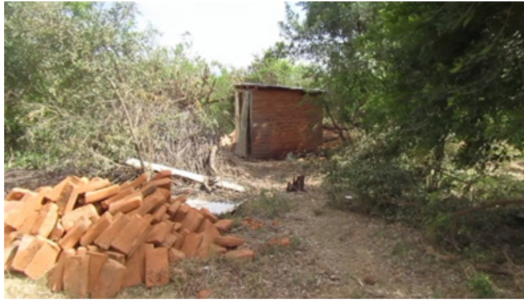
Shower and latrine module